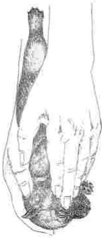
Figure # 4 Figure Supine position